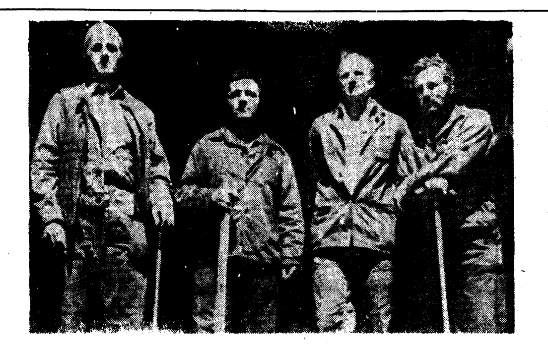
Striking workers, armed with clubs, guard the Lenin Shipyard in Gdansk. The ruling class is waiting for the workers' guard to go down before it launches its counter-attack. Workers will soon need more than clubs.

This sort of venom is what we imagine the financial editors say privately when they are done prating about the Polish workers' heroism. It is also what their counterparts in the Stalinist planning bureaus sneer under their breath, the distilled essence of bourgeois economic wisdom, freed from cant: "Let the workers pay" and "All these shiftless burns want is a free ride." Significantly, in criticizing the workers in this passage, the Spartacists support the petty-bourgeois dissidents