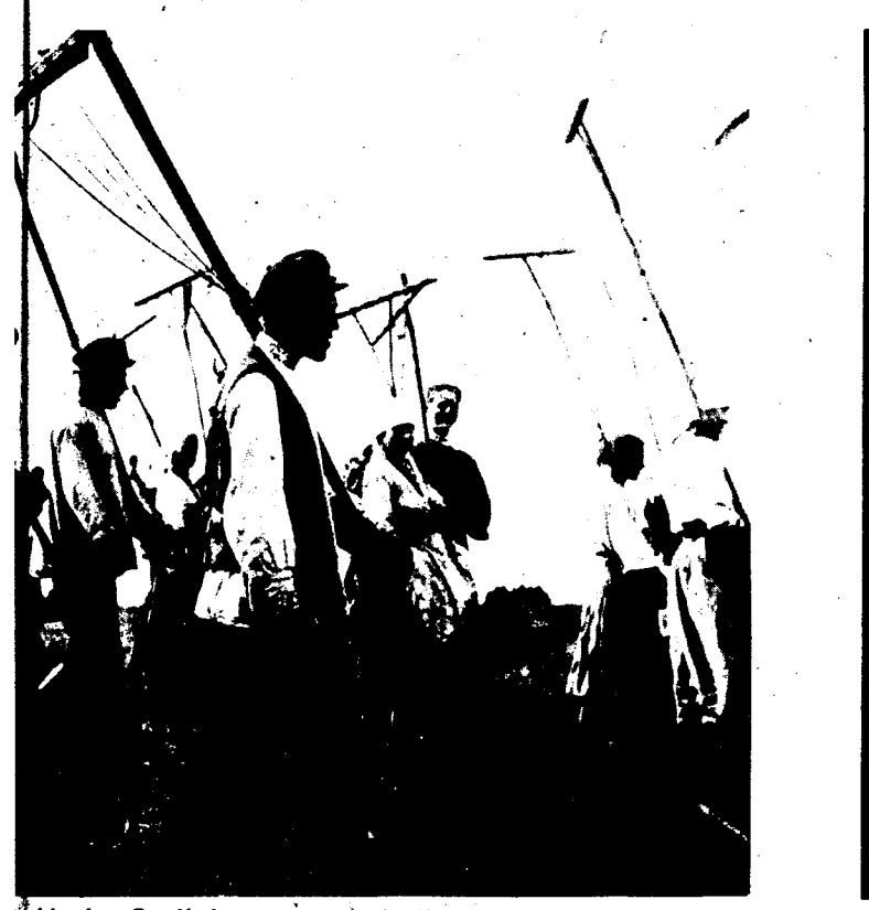
Under Stalinist state capitalism, farm productivity that consumer goods investment is inevitably diover food shortages and high prices.

The enormous stockpiling of unusable goods, frequently unfinished and of low quality, shows the fictitious character of much of the growth that took place under Stalinism. It reflects the Marxist law that under capitalism in its epoch of decay, the value-form of production is a brake upon the organic development of the means of production and therefore of useful goods. In the bureaucratically run economies, the relative lack of competition permits even greater obsolete capital and fictitious valuation than otherwise. The inconvertibility and black-market trading of the Russian and Eastern European currencies is a striking indication of this fiction. Zwass' conclusion that the enormous waste wipes out