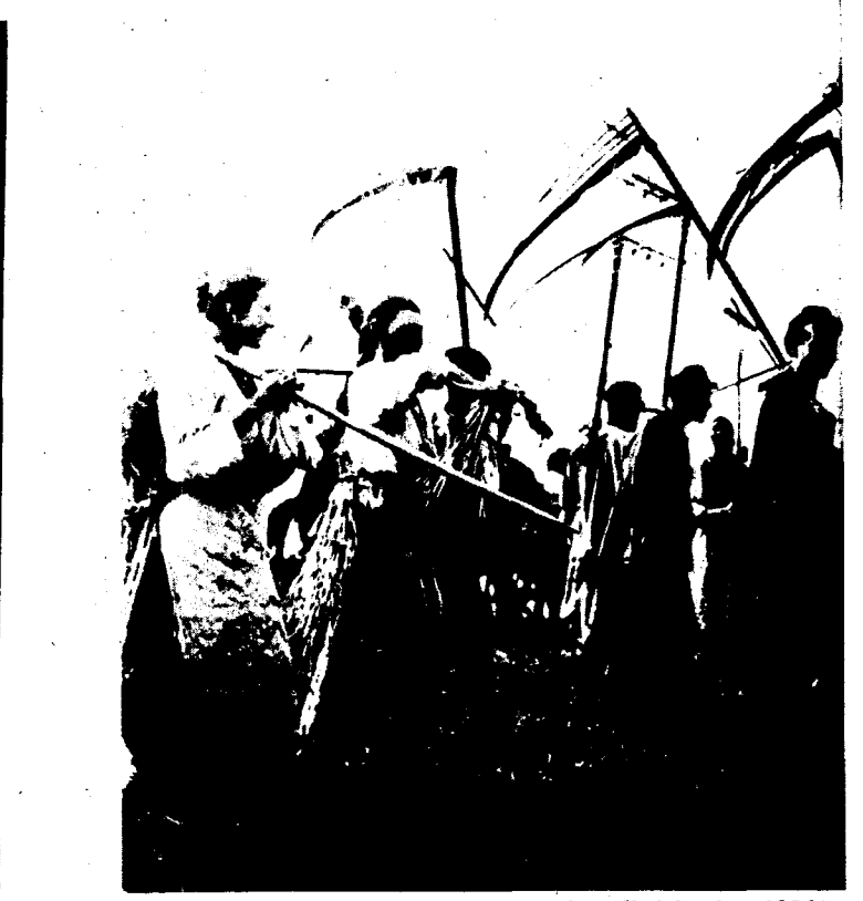
Russian peasants march to the fields in 1920's. is notoriously low. Drive for accumulation means verted. Thus crises, as in Poland, frequently occur

"The following comparison of economic growth and inventories shows clearly the true value of the muchprized 'growth' in the Eastern European countries. From 1971 to 1973, Polish gross bational product increased by 334.1 billion zlotys, while inventories in-