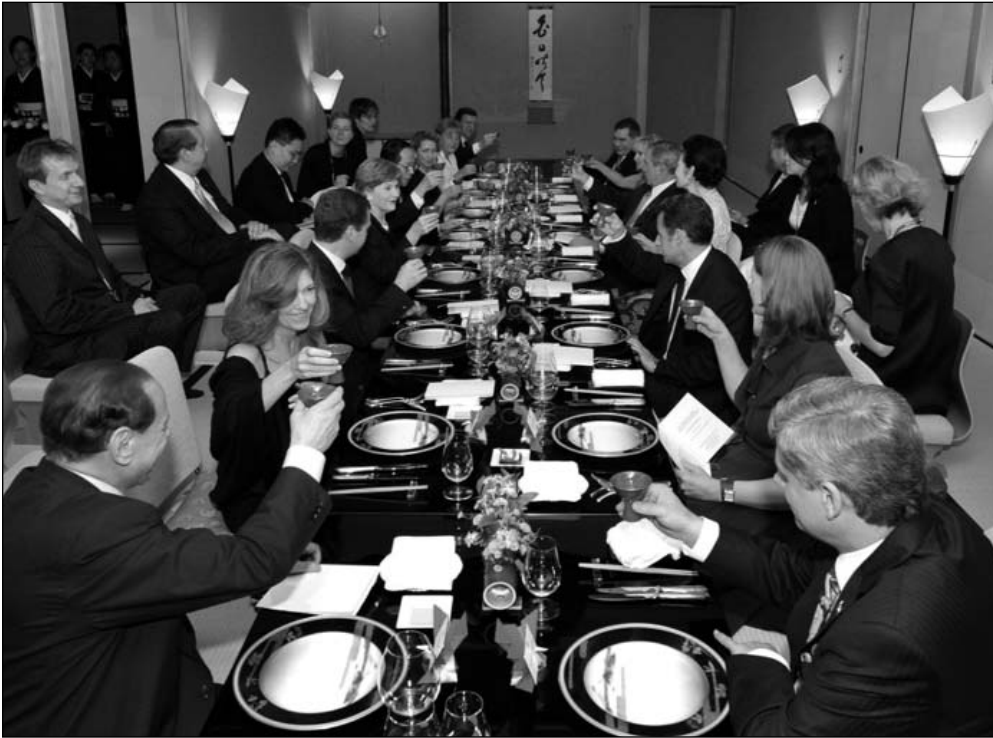
Lavish eighteen-course banquet for imperialist leaders at G8 Summit on food crisis in Japan, July 2008. Financial speculation drove up world food prices and threatened tens of millions with starvation.

extending it whatever credit they can. The pressure of repaying bailout debts will be a major factor driving the struggle between rival capitalist states in the coming period.