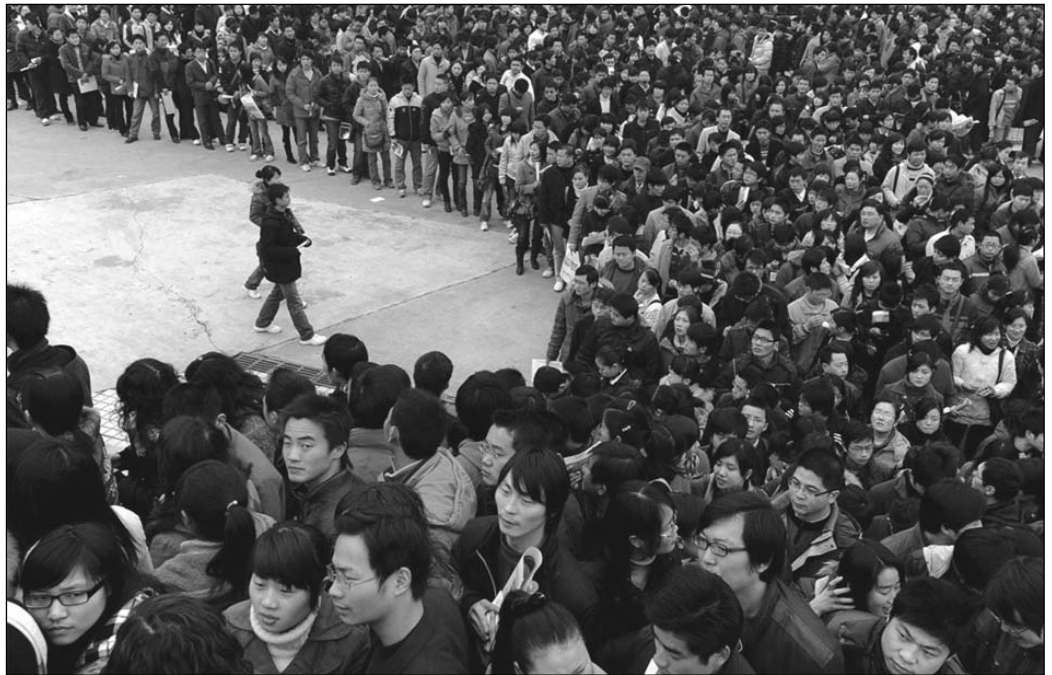
March 2009: Thousands of Chinese workers flocking to a job fair. Tens of thousands of factories closed in China at the height of the global crisis, and over 20 million of China's 130 million migrant laborers lost their jobs.

But the bailouts did not stop the crisis from spreading. Industrial manufacturing, construction and trade plummeted, and waves of layoffs claimed tens of millions of jobs worldwide. Mainstream capitalist commentators are referring to the crisis as “the Great Recession” – an extreme version of the system's peri-