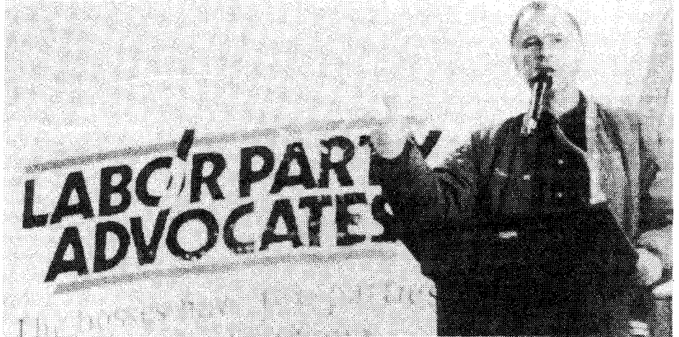
Former Democratic Party presidential aspirant Jerry Brown at LPA meeting. New 'Labor Party' can't break with capitalist Democrats.